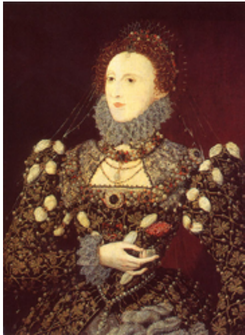
Queen Elizabeth I

Lamb of God, who takes away the sin of the world, grant us peace.