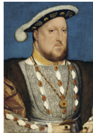
King Henry VIII

In manus tuas, Domine, commendo spiritum meum. Redemisti me, Domine, Deus veritatis. Redemisti me, Domine, Deus veritatis.