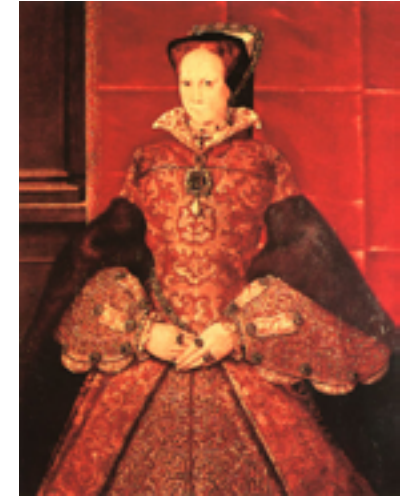
Queen Mary I